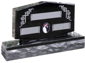
Monuments & Vases