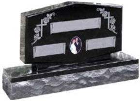
Monuments & Vases