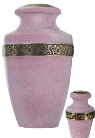
Pink Milano & Pink Milano Keepsake

Brass urn with floral band detail and speckled pink finish