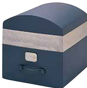
Clark Stainless Steel 12 Gauge Stainless Steel