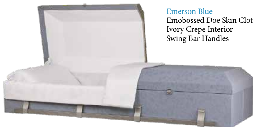
Emerson Blue Embossed Doe Skin Cloth Covered Ivory Crepe Interior Swing Bar Handles