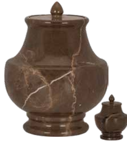
Mallorca & Mallorca Keepsake Solid marble urn