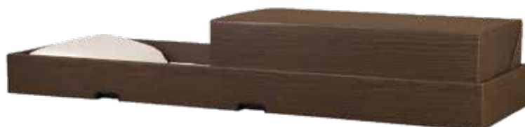
TransPorter® Woodgrain Paper Exterior Ivory Crepe Interior