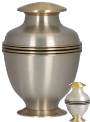
Venice & Venice Keepsake Brass urn with pewter finish in classic design