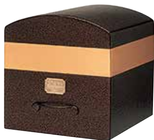
Clark Copper 12 Gauge Copper