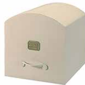
Clark Aluminum 1/8" Aluminum