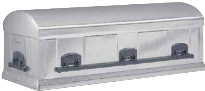
12 Gauge Steel