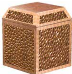
Oxford Painted Concrete & Polymer Liner