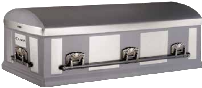
12 Gauge Stainless Steel