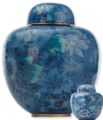
Blue Sapphire & Blue Sapphire Keepsake Traditional cloisonné design with intricate pattern