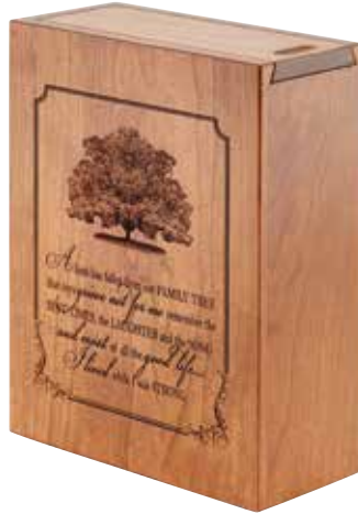
Family Tree Scattering Urn Cherry scattering urn with engraved image & quote