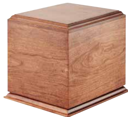
Avon Cherry Cherry hardwood urn with natural finish