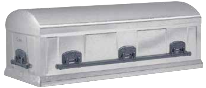
7, 10, or 12 Gauge Galvanized Steel