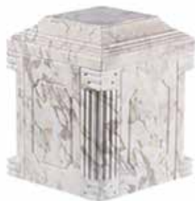
Aegean Concrete & Thermoformed Polymer