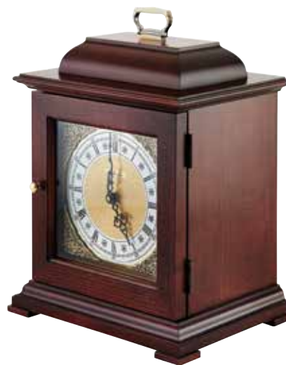
Highland Handcrafted timepiece of solid maple has a decorative brass face with quartz time-keeping Westminster chime