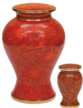
Autumn Leaves & Autumn Leaves Keepsake Cloisonné urn handcrafted in warm autumn red with leaf and floral pattern