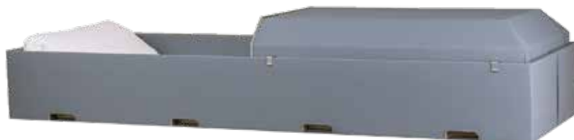
Harmony Blue Cloth Covered Ivory Crepe Interior