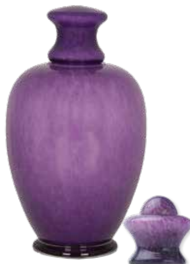
Amphora Violet & Amphora Violet Keepsake Elegant and distinctive handblown glass urn in shades of violet