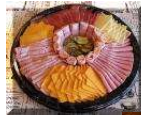
# 1 Meat & Cheese Trays, Bread, Salads, Chips and Cake $4.95/person