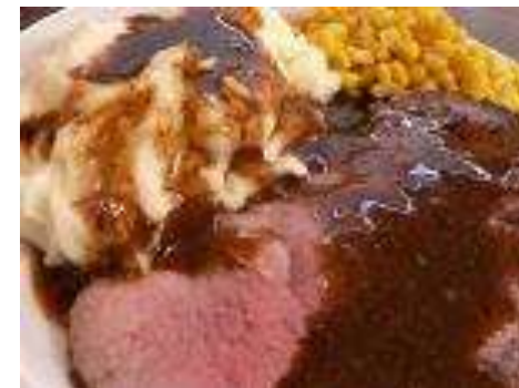
#3 Hot Roast Beef, Cheesy Potatoes, Vegetable, Roll & Butter and Cake $9.95/person