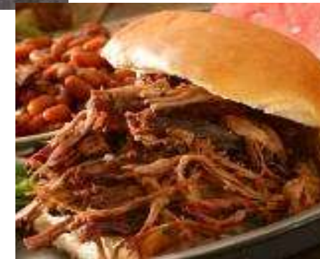
#2 Hot Sandwiches (Beef or Pork), Buns, Salads, Chips and Cake $6.95/person