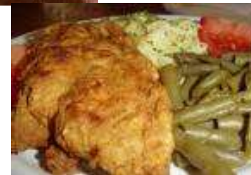
#4 Fried Chicken, Mashed Potatoes, Vegetable, Roll & Butter and Cake $10.75 /person