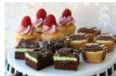
#5 Cake or Cookies $2.50/person