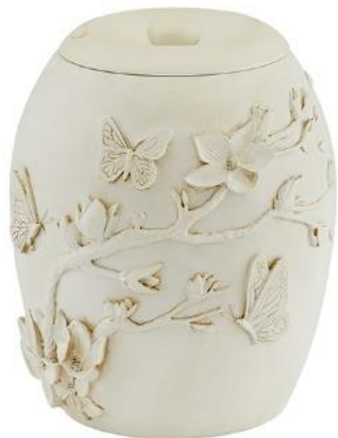
Standard Urns: Mother of Pearl/Seaside/Spartan Tall Bronze/Renton/Spartan Dark/Blossoms Butterflies