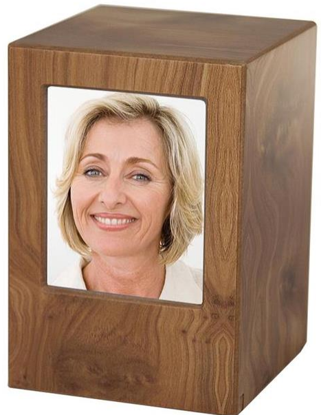
Standard Urns: Mother of Pearl/Seaside/Renton/Hudson Blue/Spartan Dark/Simplicity