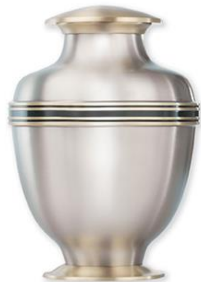
Preferred Urns: Glade Mist/Angel Alabaster/Walnut Scattering/Grecian Crimson/Amherst Walnut/Venice