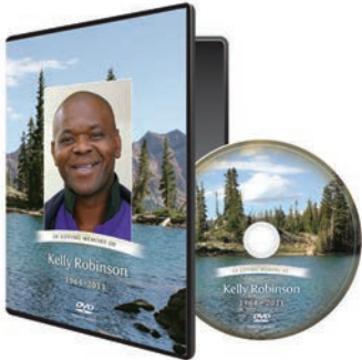
Custom DVD Case