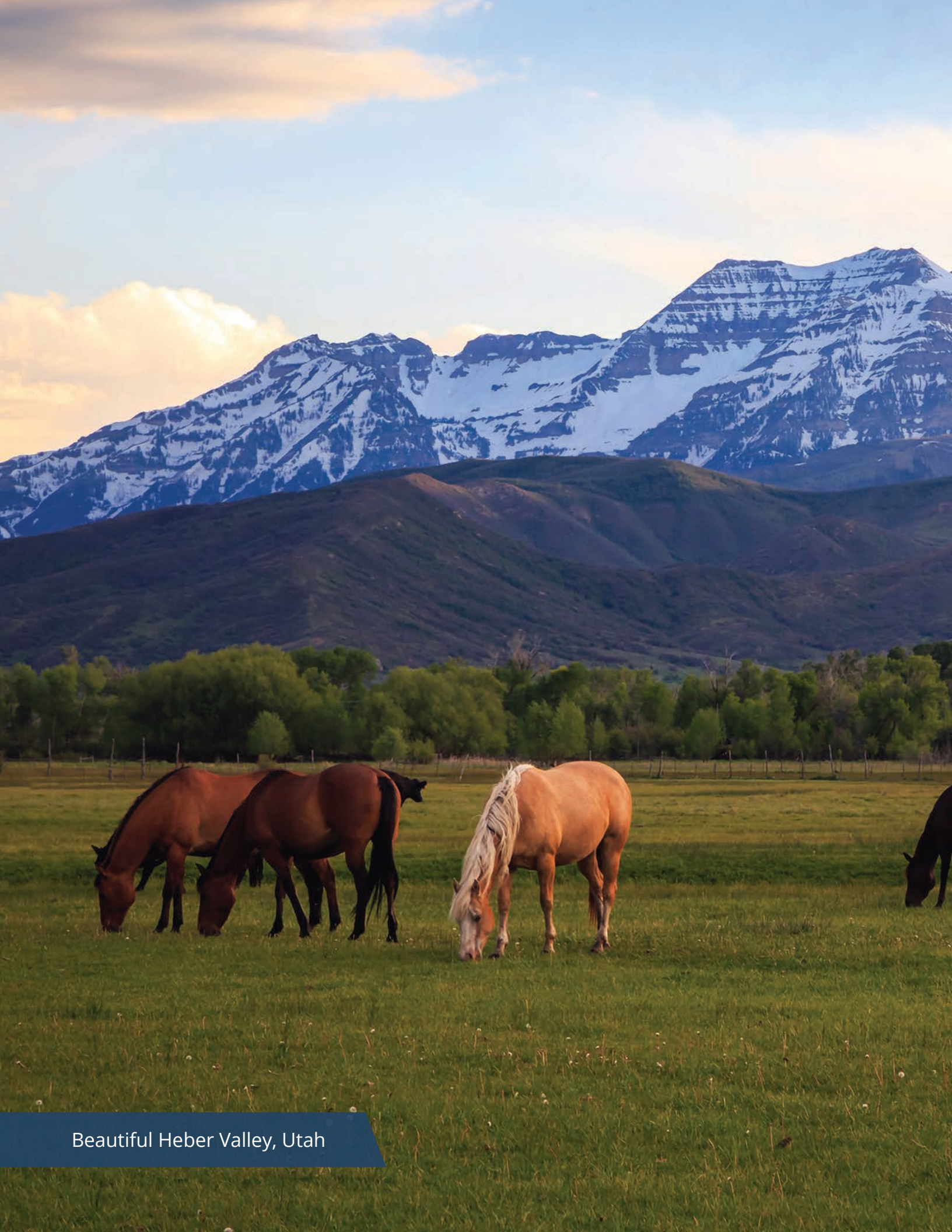
Beautiful Heber Valley, Utah