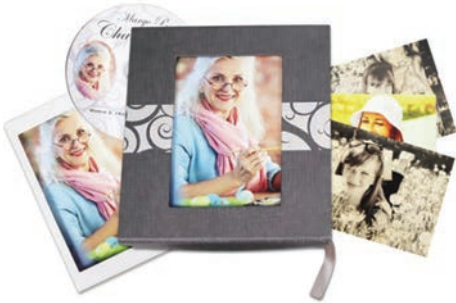
DVD Tribute Box Set