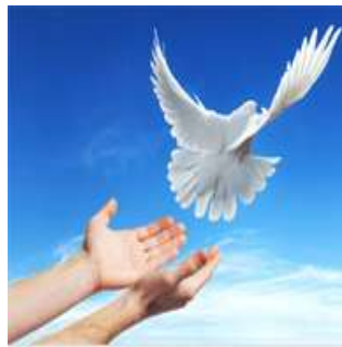
Dove Release Flight Home

Create a special piece that you can wrap yourself in for years to come. Use your favorite photo, or let us create a collage of photos and elements that will make this blanket an incredible comfort.