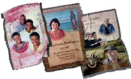
Woven Photo Blanket

Custom Jewelry using the fingerprint of your loved one or a special image to remember Jewelry includes the pendant and chain in Sterling Silver.