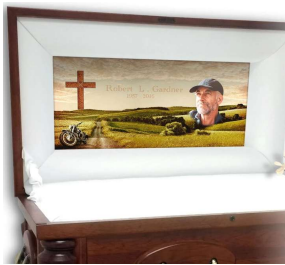
Custom Cap Panel

This Wooden Flag case proudly displays a Veterans Flag in all its proper glory. Meticulously crafted, it is truly a stunning and safe way to keep the your loved one's honor alive.