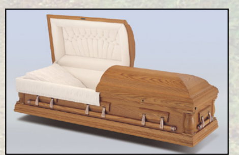
CAMERON OAK Premium Champagne Velvet Interior $4,495