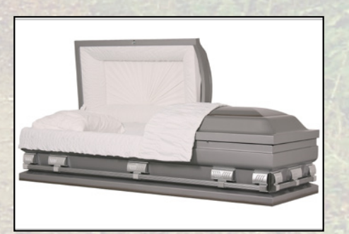
REED SILVER 29, 20 GAUGE NON-GASKET White Crepe Interior $3,195