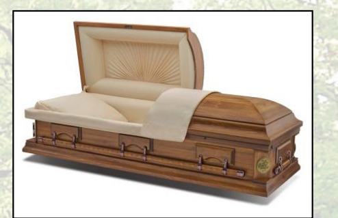
BAILEY, SELECT HARDWOOD VENEER-MEDIUM Khaki Linwood Interior $3,495