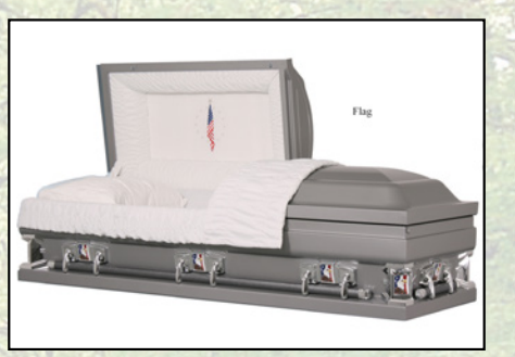
OLYMPIC SILVER 27, 20 GAUGE White Crepe Interior $3,495