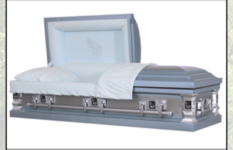
BLUE MIST Light Blue Velvet Interior $4,495

TAPESTRY ROSE Pink Velvet Interior $4,495