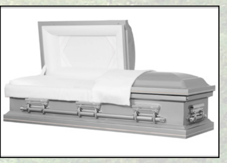
TIMELESS SILVER, 20 GAUGE White Crepe Interior $2,995