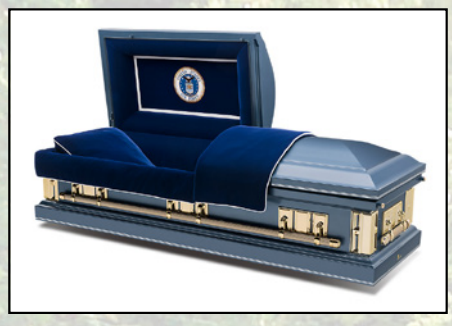
SYDNEY, 18 GAUGE Blue with Silver Trim Velvet Interior $3,495