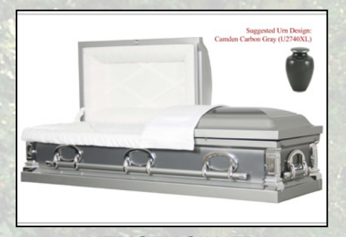
MEMORY SILVER & GRAPHITE CEREMONIAL Cremation Rental, Two Tone Silver & Graphite, White Chalet Crepe Interior $1,995