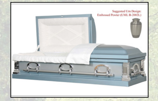
MEMORY LIGHT BLUE CEREMONIAL Cremation Rental, Two Tone Silver & Light Blue, White Chalet Crepe Interior $1,995