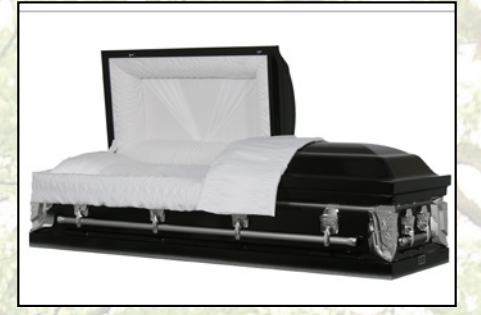
ESSEX EBONY, 20 GAUGE White Crepe Interior $2,695

COBALT, 20 GAUGE Blue Crepe Interior $2,795