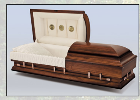
MANSFIELD SELECT HARDWOOD Rosetan Crepe Interior $3,695