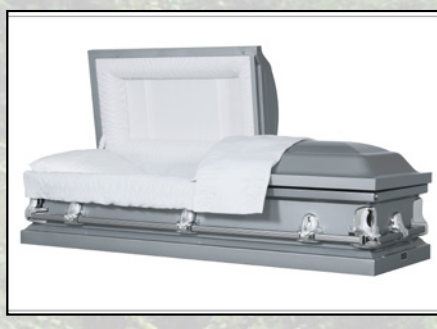
SIERRA SILVER, 20 GAUGE White Crepe Interior $2,295