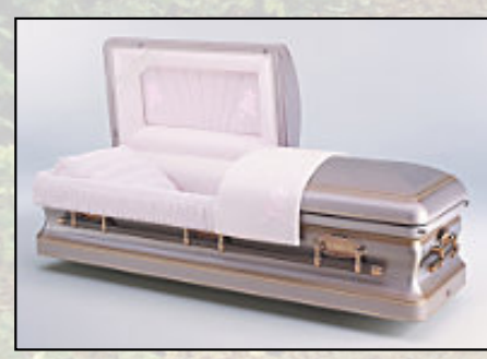
RENAISSANCE ROSE PREMIUM Premium Moss Pink Velvet Interior $5,795