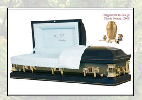
IN GOD'S CARE CEREMONIAL Cremation Rental, Gold Burnishing Dark Blue Rails, Blue Chalet Crepe Interior $2,395