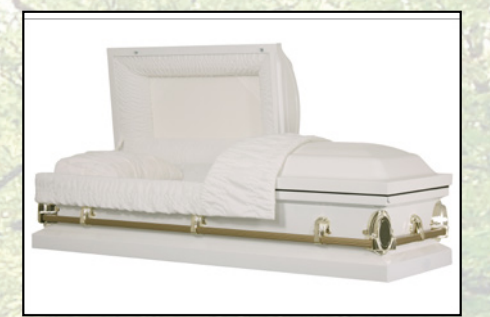
HARTLEY WHITE, 20 GAUGE White Crepe Interior $2,495