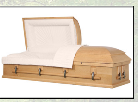
SANDWOOD VENEER Rosetan Crepe Interior $2,595