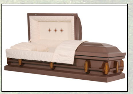
AUSTIN BRONZE, 20 GAUGE Rosetan Crepe Interior $2,195