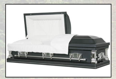
ASCENT METALLIC GRAPHITE, 20 GAUGE White Crepe Interior $2,995