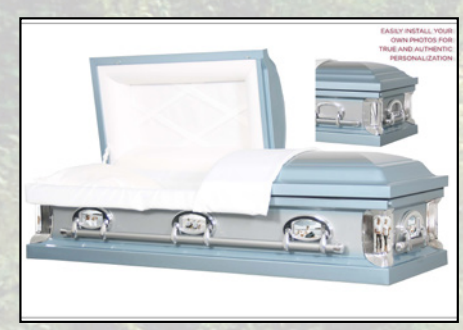
REMINISCE LIGHT BLUE, 20 GAUGE White Crepe Interior $2,995