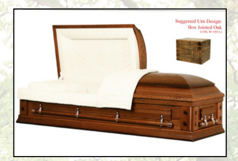
NORWOOD OAK Cremation Rental, Medium Brown Satin Finish, Rosentan Chalet Crepe Interior $2,095