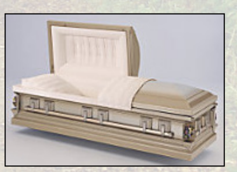
GOLDEN SAND Premium Champagne Velvet Interior $4,695