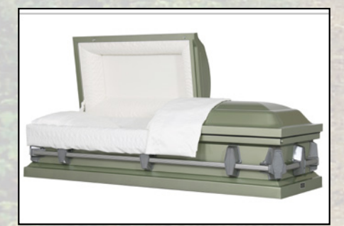
COLESVILLE SEAMIST, 20 GAUGE Eggshell Crepe Interior $2,095