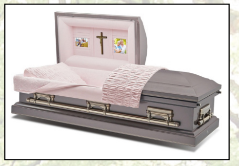
TUSCANY, 18 GAUGE Moss Pink Velvet With A Dual Overlay (Lace Or Tailored) $3,495