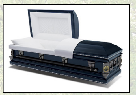
NEOPOLITAN BLUE, 20 GAUGE Ivory Velvet Interior $3,295