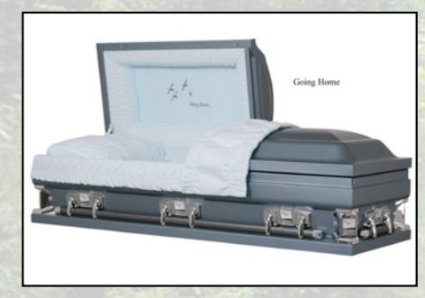
OLYMPIC BLUE 27, 20 GAUGE Blue Crepe Interior $3,495