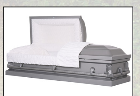
WINSTON SILVER, 20 GAUGE NON-GASKETED White Crepe Interior $1,595