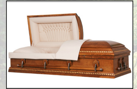
TACOMA SOLID POPLAR Basketweave Interior $3,795