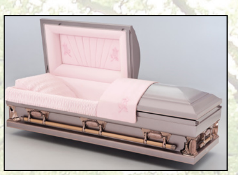
OU8 AUTUMN ROSE 28, 18 GAUGE Moss Pink Velvet Interior $3,895