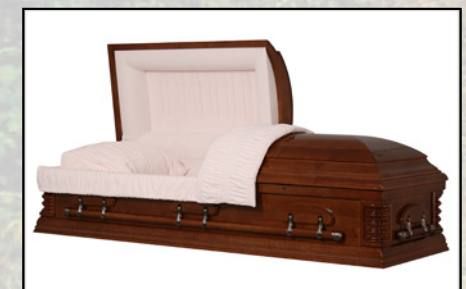
ALLEGHANY SOLID CHERRY Rosentan Velvet Interior $6,695