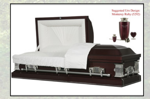
ASCENT BLUSH CEREMONIAL White Chalet Crepe Interior $1.395