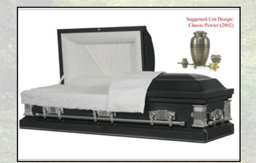
ASCENT GRAPHITE CEREMONIAL Cremation Rental, Metallic Graphite With Silver Pinstripe, Cremation Rental, Metallic Blush With Silver Pinstripe, White Chalet Crepe Interior $1,395

GOLDEN CROSS CEREMONIAL Cremation Rental, White With Gold Pinstripe, White Chalet Crepe Interior $1.595