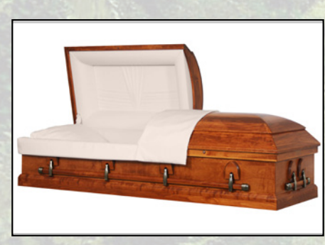
COLLINWOOD VENEER Rosetan Crepe Interior $3,195