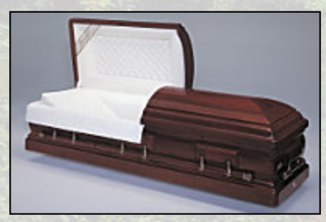
PREMIER MAHOGANY Premium Champagne Velvet Interior $7,395