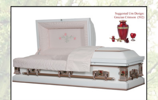
WHITE ROSE CEREMONIAL Cremation Rental, White Shaded Rose, Pink Chalet Crepe Interior $2,195