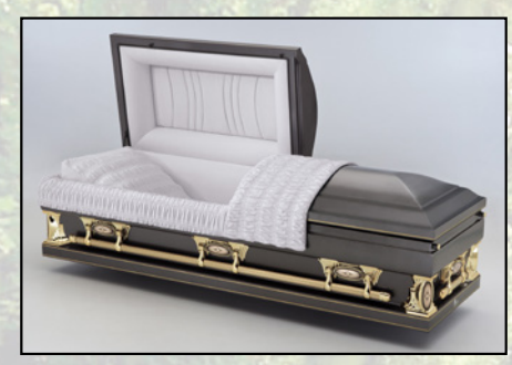
OU7 WYNTER GREY 28, 18 GAUGE Silver Velvet Interior $3,895