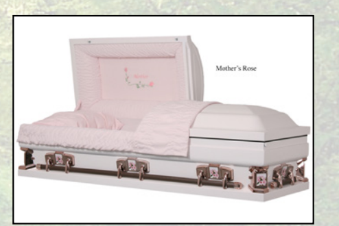
OLYMPIC WHITE & PINK 27, 20 GAUGE Pink Crepe Interior $3,495