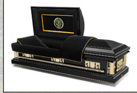
MIDNIGHT WITH GOLD TRIM 18 GAUGE Black with Gold Trim Velvet Interior $3,495