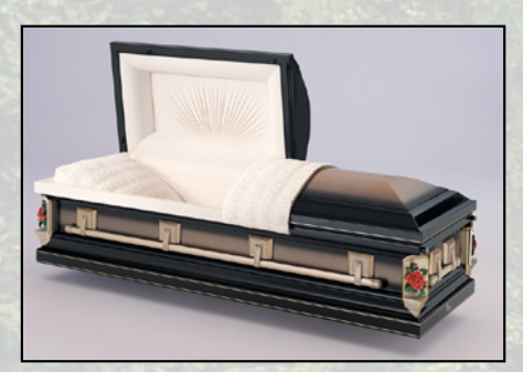
GOLDEN MIDNIGHT, 18 GAUGE Champagne Velvet Interior $4,295