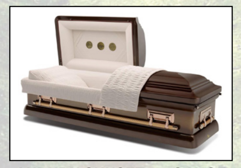
AUBURN SUNSET, 18 GAUGE Champagne Velvet Interior $3,695