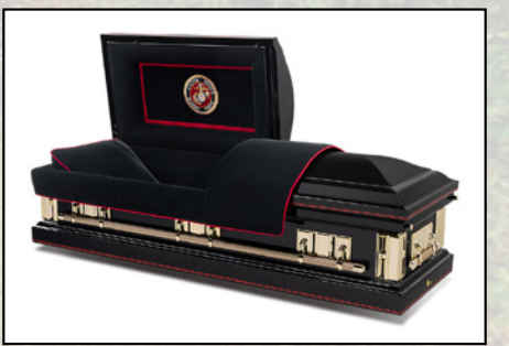
MIDNIGHT WITH RED TRIM 18 GAUGE Black with Red Trim Velvet Interior $3,495