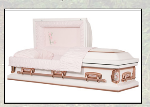
CARNATION, 20 GAUGE Pink Crepe Interior $2,895