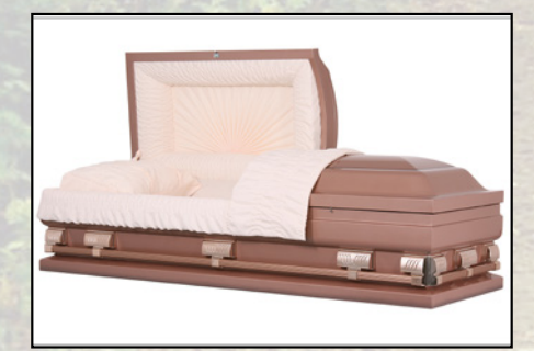
REED COPPER 29, 20 GAUGE NON-GASKET Rosetan Crepe Interior $3,195