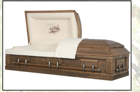
BARNWOOD SOLID OAK Natural Cotton Interior $3,995

WOODHAVEN PECAN Premium Champagne Velvet Interior $4,095