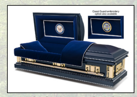
NEOPOLITAN, 18 GAUGE Blue with Silver Trim Velvet Interior $3,595