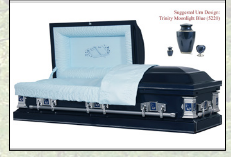
LORD'S PRAYER CEREMONIAL Cremation Rental, Dark Blue With Silver Pinstripe, Blue Chalet Crepe Interior $1,795