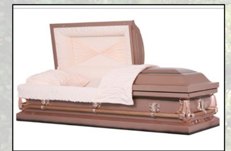
TREEMONT COPPER, 20 GAUGE Rosentan Crepe Interior $2,595