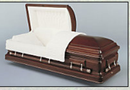
PEMBROKE CHERRY Premium Champagne Velvet Interior $6,895