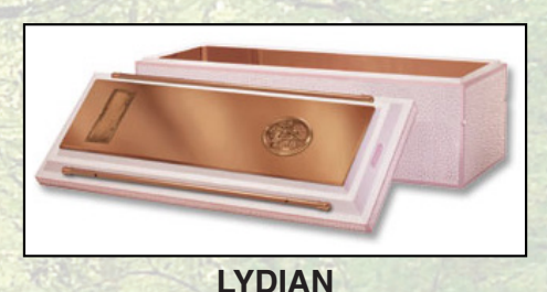
Concrete Exterior, Lustra-Tech Polymer Liner, Copper Lined Lid and Bottom, Full Lid Carapace to Include Personalization $4,195