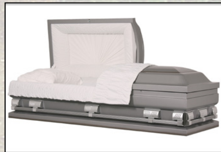
REED SILVER 29, 20 GAUGE NON-GASKET White Crepe Interior $3,195