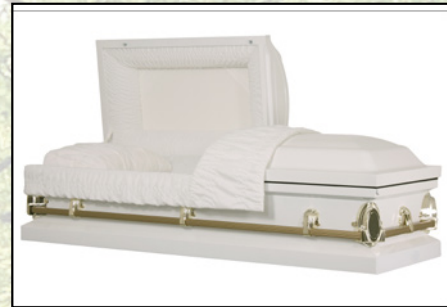
HARTLEY WHITE, 20 GAUGE White Crepe Interior $2,495