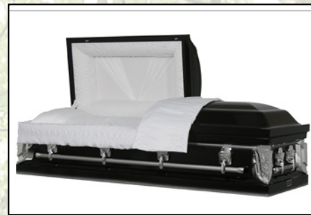
ESSEX EBONY, 20 GAUGE White Crepe Interior $2,695