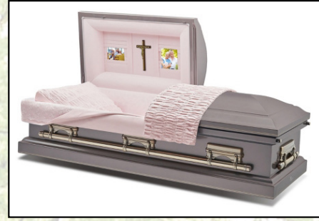
TUSCANY, 18 GAUGE Moss Pink Velvet With A Dual Overlay (Lace Or Tailored) $3,495