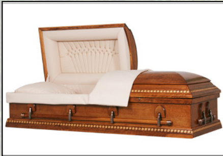
TACOMA SOLID POPLAR Basketweave Interior $3,795