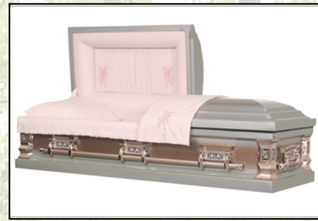
TAPESTRY ROSE Pink Velvet Interior $4,495