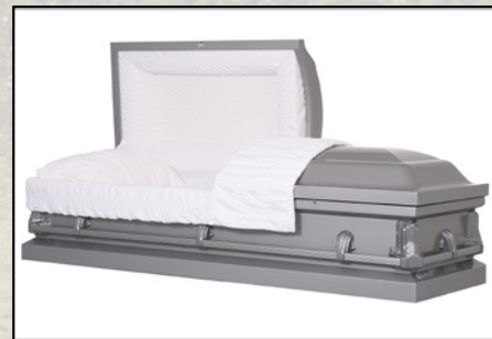
WINSTON SILVER, 20 GAUGE NON-GASKETED White Crepe Interior $1,595