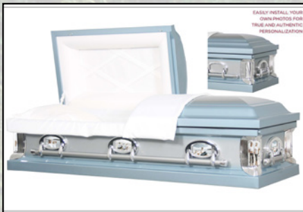
REMINISCE LIGHT BLUE, 20 GAUGE White Crepe Interior $2,995