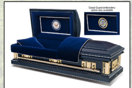
NEOPOLITAN, 18 GAUGE Blue with Silver Trim Velvet Interior $3,595