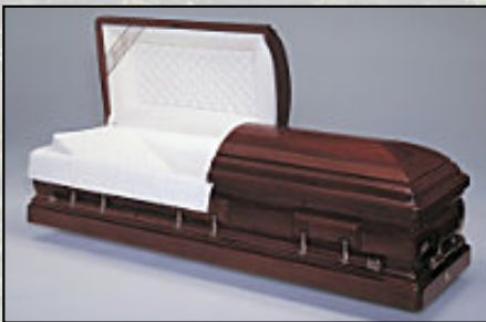
PREMIER MAHOGANY Premium Champagne Velvet Interior $7,395