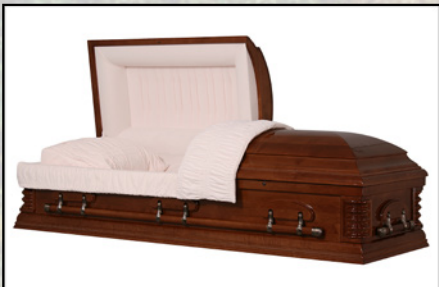
ALLEGHANY SOLID CHERRY Rosentan Velvet Interior $6,695