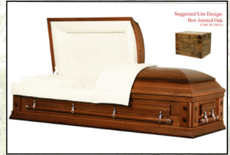
NORWOOD OAK Cremation Rental, Medium Brown Satin Finish, Rosentan Chalet Crepe Interior $2,095