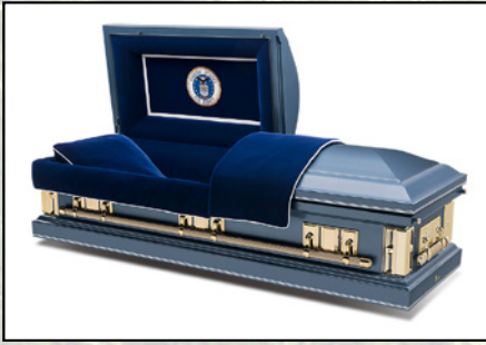
SYDNEY, 18 GAUGE Blue with Silver Trim Velvet Interior $3,495