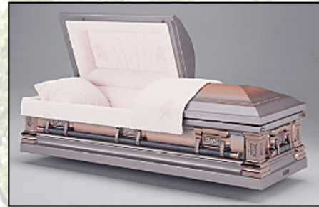
TAPESTRY ROSE, 32 OZ. COPPER Premium Moss Pink Velvet Interior $7,095