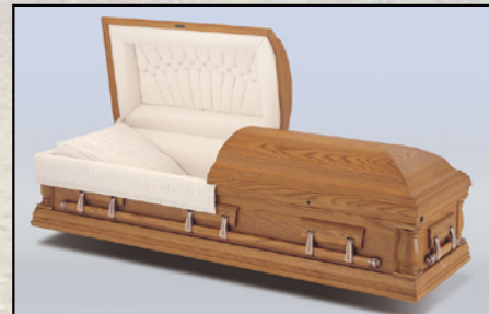
CAMERON OAK Premium Champagne Velvet Interior $4,495