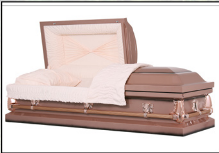
TREMONT COPPER, 20 GAUGE Rosentan Crepe Interior $2,595