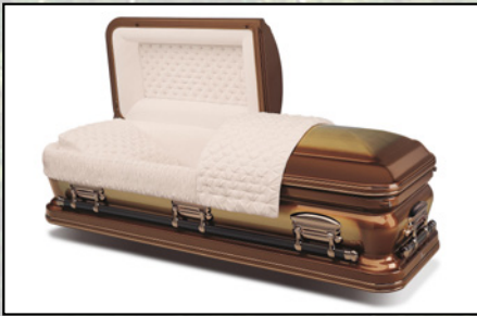
VENETIAN BRONZE, 48 OZ. BRONZE Premium Champagne Velvet Interior $9,595