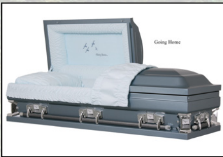
OLYMPIC BLUE 27, 20 GAUGE Blue Crepe Interior $3,495