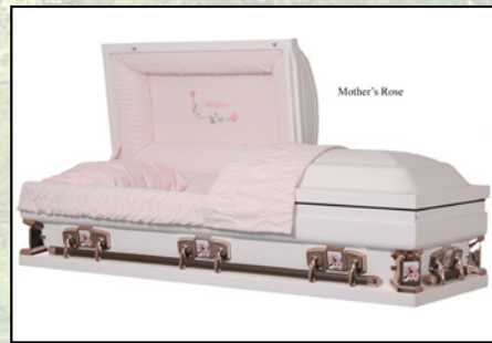
OLYMPIC WHITE & PINK 27, 20 GAUGE Pink Crepe Interior $3,495