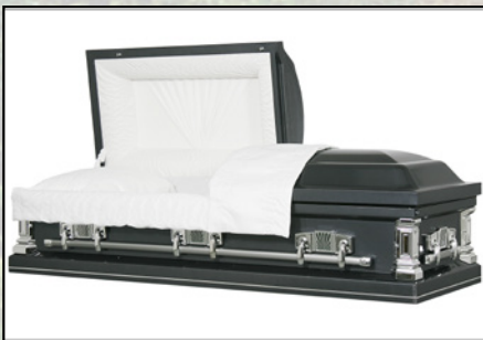
ASCENT METALLIC GRAPHITE, 20 GAUGE White Crepe Interior $2,995