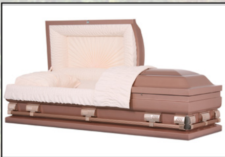
REED COPPER 29, 20 GAUGE NON-GASKET Rosetan Crepe Interior $3,195