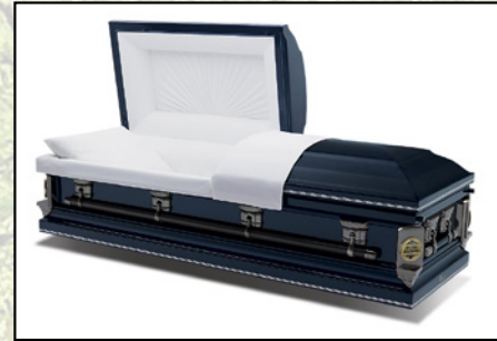
NEOPOLITAN BLUE, 20 GAUGE Ivory Velvet Interior $3,295