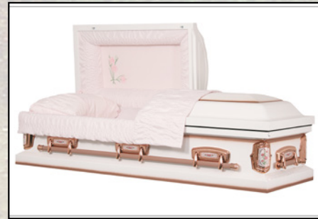
CARNATION, 20 GAUGE Pink Crepe Interior $2,895