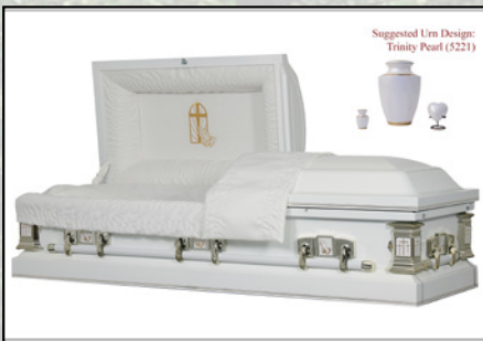
GOLDEN CROSS CEREMONIAL Cremation Rental, White With Gold Pinstripe, White Chalet Crepe Interior $1,595