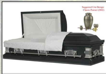
ASCENT GRAPHITE CEREMONIAL Cremation Rental, Metallic Graphite With Silver Pinstripe, White Chalet Crepe Interior $1,395