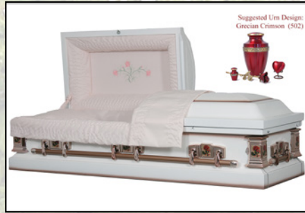
WHITE ROSE CEREMONIAL Cremation Rental, White Shaded Rose, Pink Chalet Crepe Interior $2,195