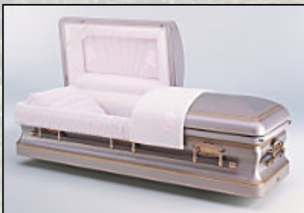
RENAISSANCE ROSE PREMIUM Premium Moss Pink Velvet Interior $5,795