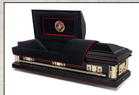
MIDNIGHT WITH RED TRIM 18 GAUGE Black with Red Trim Velvet Interior $3,495