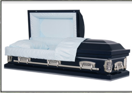
COBALT, 20 GAUGE Blue Crepe Interior $2,795