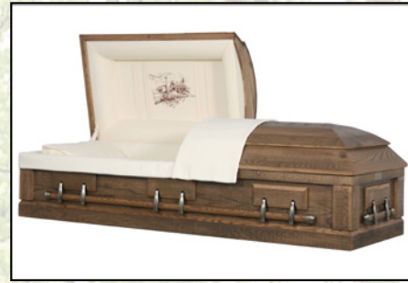
BARNWOOD SOLID OAK Natural Cotton Interior $3,995