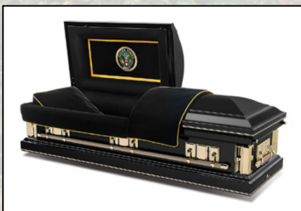
MIDNIGHT WITH GOLD TRIM 18 GAUGE Black with Gold Trim Velvet Interior $3,495