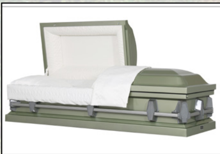
COLESVILLE SEAMIST, 20 GAUGE Eggshell Crepe Interior $2,095