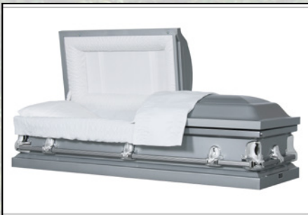
SIERRA SILVER, 20 GAUGE White Crepe Interior $2,295