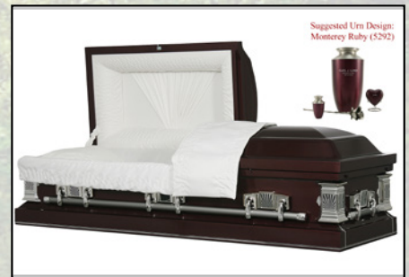
ASCENT BLUSH CEREMONIAL Cremation Rental, Metallic Blush With Silver Pinstripe, White Chalet Crepe Interior $1,395