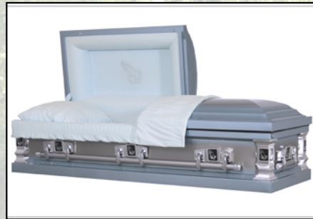
BLUE MIST Light Blue Velvet Interior $4,495