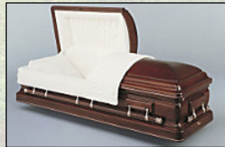
PEMBROKE CHERRY Premium Champagne Velvet Interior $6,895