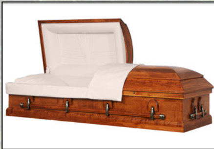
COLLINWOOD VENEER Rosetan Crepe Interior $3,195