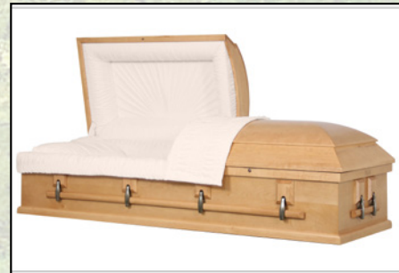
SANDWOOD VENEER Rosetan Crepe Interior $2,595