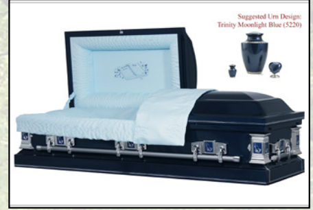
LORD'S PRAYER CEREMONIAL Cremation Rental, Dark Blue With Silver Pinstripe, Blue Chalet Crepe Interior $1,795