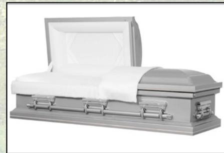
TIMELESS SILVER, 20 GAUGE White Crepe Interior $2,995