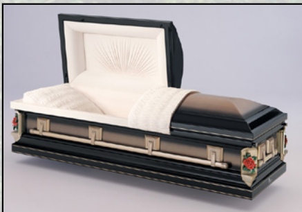
GOLDEN MIDNIGHT, 18 GAUGE Champagne Velvet Interior $4,295