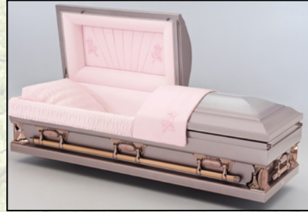
OU8 AUTUMN ROSE 28, 18 GAUGE Moss Pink Velvet Interior $3,895