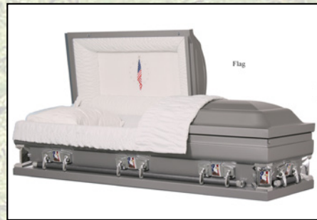
OLYMPIC SILVER 27, 20 GAUGE White Crepe Interior $3,495