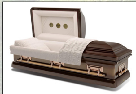
AUBURN SUNSET, 18 GAUGE Champagne Velvet Interior $3,695