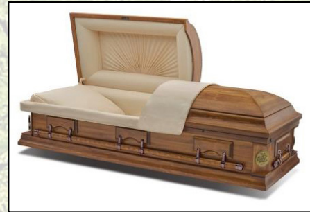
BAILEY, SELECT HARDWOOD VENEER-MEDIUM Khaki Linwood Interior $3,495