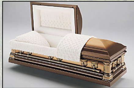
AEGEAN COPPER, 32 OZ. COPPER Premium Champagne Velvet Interior $6,695