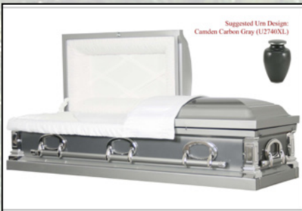
MEMORY SILVER & GRAPHITE CEREMONIAL Cremation Rental, Two Tone Silver & Graphite, White Chalet Crepe Interior $1,995