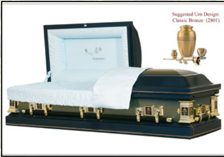
IN GOD'S CARE CEREMONIAL Cremation Rental, Gold Burnishing Dark Blue Rails, Blue Chalet Crepe Interior $2,395