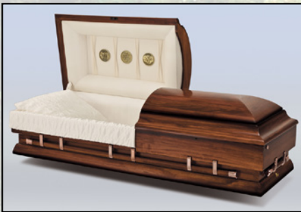
MANSFIELD SELECT HARDWOOD Rosetan Crepe Interior $3,695