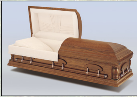
WOODHAVEN PECAN Premium Champagne Velvet Interior $4,095