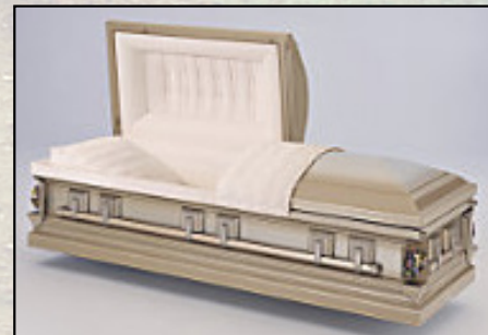
GOLDEN SAND Premium Champagne Velvet Interior $4,695