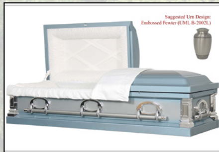
MEMORY LIGHT BLUE CEREMONIAL Cremation Rental, Two Tone Silver & Light Blue, White Chalet Crepe Interior $1,995