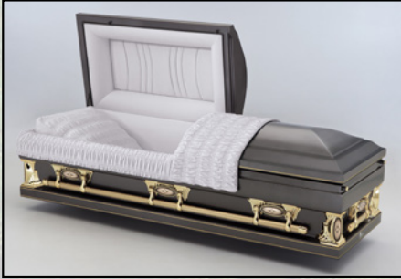
OU7 WYNTER GREY 28, 18 GAUGE Silver Velvet Interior $3,895