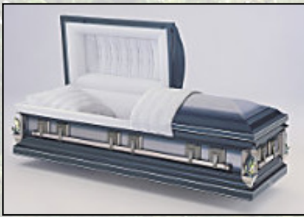
SILVER SAPPHIRE Premium Silver Velvet Interior $4,695