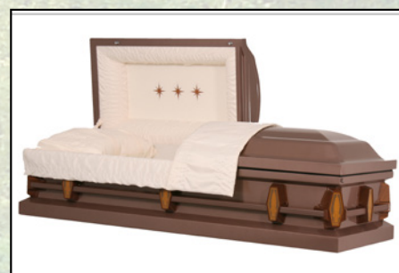
AUSTIN BRONZE, 20 GAUGE Rosentan Crepe Interior $2,195