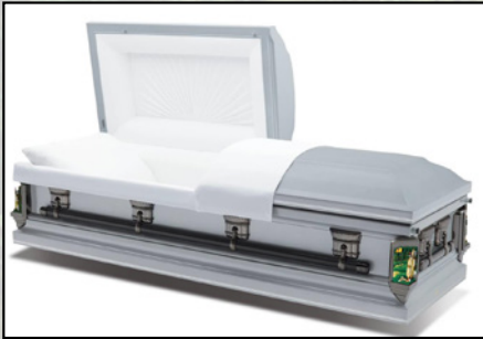
REVERE SILVER, 20 GAUGE Ivory Velvet Interior $3,295