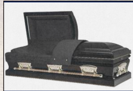
PATRIOT, 18 GAUGE Uniform Black Wool Interior $3,495