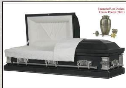
ASCENT GRAPHITE CEREMONIAL Cremation Rental, Metallic Graphite With Silver Pinstripe, White Chalet Crepe Interior $1,395