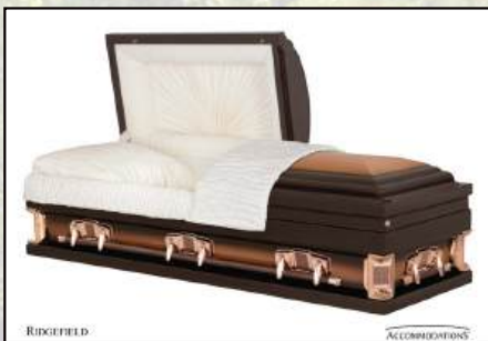
RIDGEFIELD, 18 GAUGE Rosetan Crepe Interior $3,895