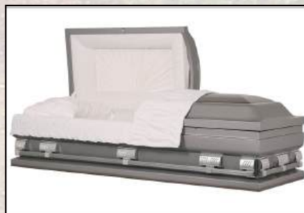
REED SILVER 29, 20 GAUGE NON-GASKET White Crepe Interior $3,195