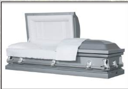
SIERRA SILVER, 20 GAUGE White Crepe Interior $2,295