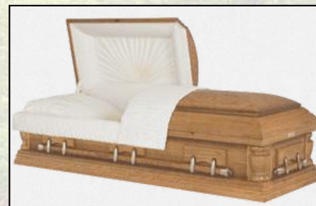
OAKWOOD OAK Rosetan Crepe Interior $4,495