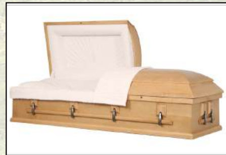
SANDWOOD VENEER Rosetan Crepe Interior $2,595