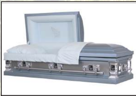
BLUE MIST, STAINLESS STEEL Light Blue Velvet Interior $4,495