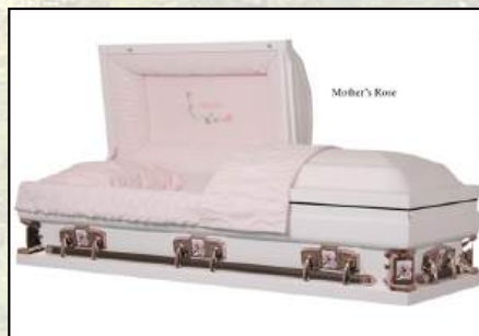
OLYMPIC WHITE & PINK 27, 20 GAUGE Pink Crepe Interior $3,495