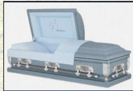
LAKESHORE, 18 GAUGE Blue Crepe Interior $3,895