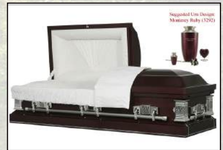
ASCENT BLUSH CEREMONIAL Cremation Rental, Metallic Blush With Silver Pinstripe, White Chalet Crepe Interior $1,395