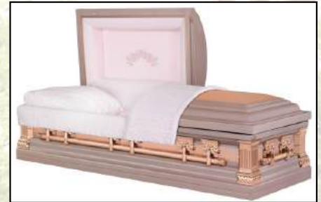
LINCOLN COPPER, 32 OZ. Pink Velvet Interior $6,695