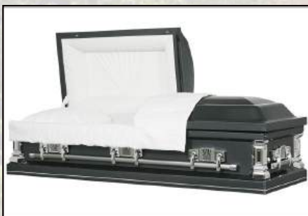
ASCENT METALLIC GRAPHITE, 20 GAUGE White Crepe Interior $2,995