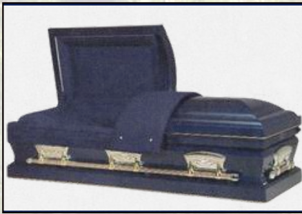
FREEDOM, 18 GAUGE Uniform Blue Wool Interior $3,495