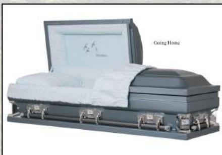
OLYMPIC BLUE 27, 20 GAUGE Blue Crepe Interior $3,495