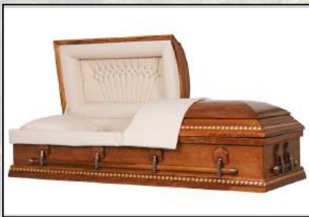
TACOMA POPLAR Rosetan Basketweave Interior $3,795