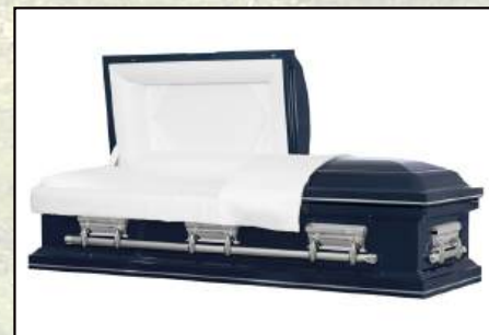
TIMELESS DARK BLUE, 20 GAUGE White Crepe Interior $2,995