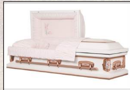
CARNATION, 20 GAUGE Pink Crepe Interior $2,895