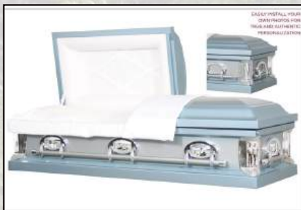
REMINISCE LIGHT BLUE, 20 GAUGE White Crepe Interior $2,995