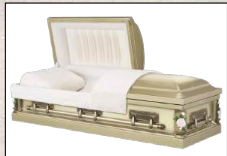
KENSINGTON STAINLESS STEEL Champagne Velvet Interior $4,695