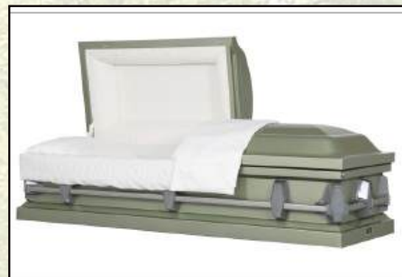
COLESVILLE SEAMIST, 20 GAUGE Eggshell Crepe Interior $2,095