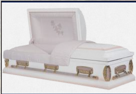
CORAL MIST, 18 GAUGE Pink Crepe Interior $3,495