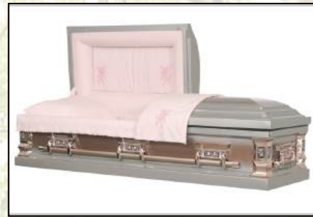
TAPESTRY ROSE, STAINLESS STEEL Pink Velvet Interior $4,495