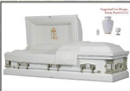
GOLDEN CROSS CEREMONIAL Cremation Rental, White With Gold Pinstripe, White Chalet Crepe Interior $1,595