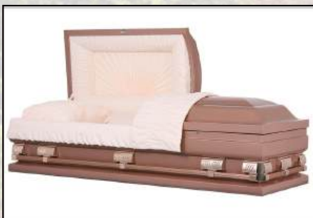
REED COPPER 29, 20 GAUGE NON-GASKET Rosetan Crepe Interior $3,195