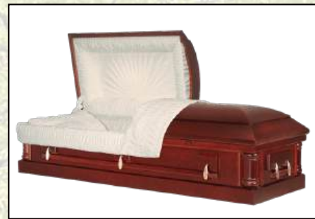
LINSAN POPLAR VENEER Rosetan Crepe Interior $3,295