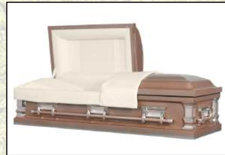
HIGHLAND COPPER, 20 GAUGE Rosetan Crepe Interior $3,095