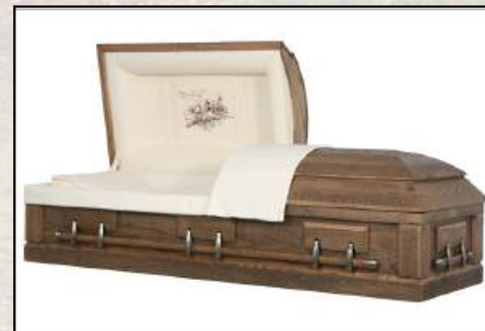
BARNWOOD OAK Natural Cotton Interior $4,095