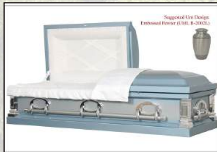
MEMORY LIGHT BLUE CEREMONIAL Cremation Rental, Two Tone Silver & Light Blue, White Chalet Crepe Interior $1,995