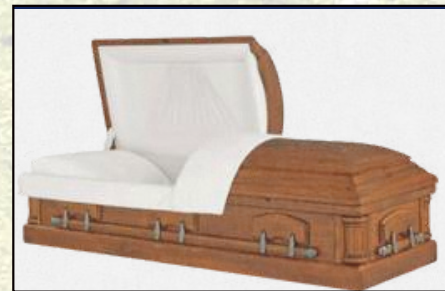
CONSTANTINE CHERRY Almond Velvet Interior $6,895