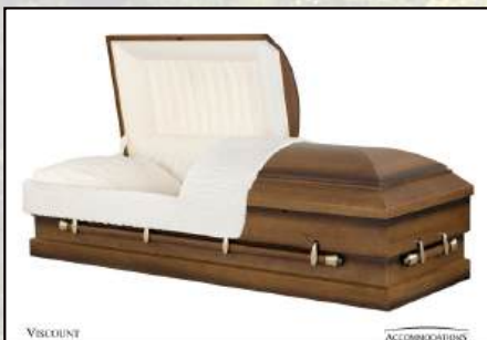
VISCOUNT POPLAR Rosetan Crepe Interior $3,795