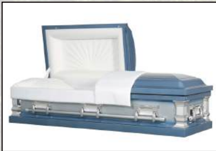
MOONLIT CASCADE AND SILVER, 20 GAUGE White Crepe Interior $3,095