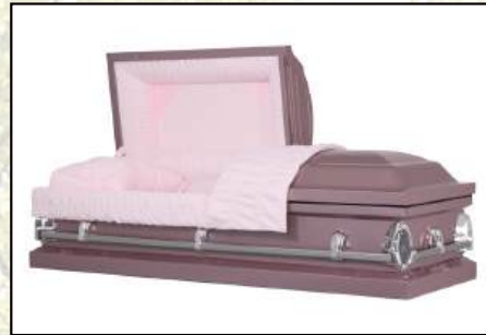
HARTLEY ORCHID, 20 GAUGE Pink Crepe Interior $2,495