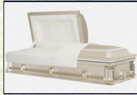
CAVALIER, 20 GAUGE Rosetan Crepe Interior $3,295