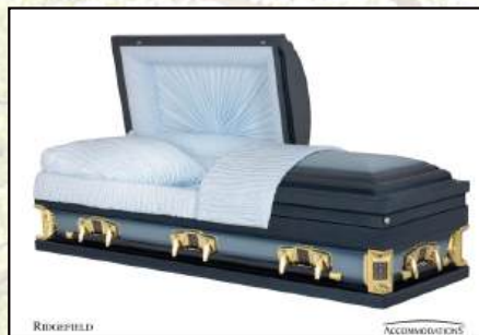
RIDGEFIELD, 18 GAUGE Blue Crepe Interior $3,895