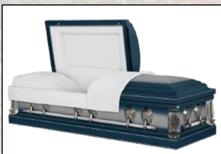
GALAXY STAINLESS STEEL Silver Velvet Interior $4,695