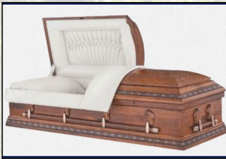
STUART SOLID POPLAR Arbutus Velvet Interior $3,895