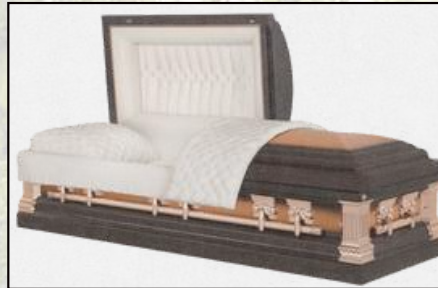
LINCOLN COPPER, 32 OZ. Almond Velvet Interior $6,695