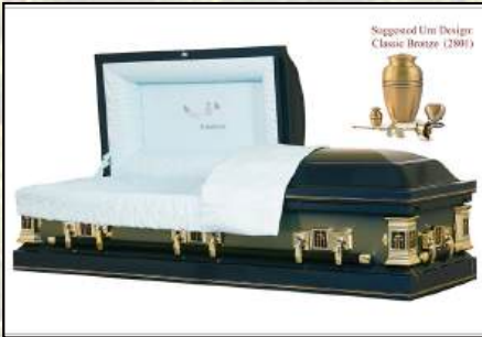
IN GOD'S CARE CEREMONIAL Cremation Rental, Gold Burnishing Dark Blue Rails, Blue Chalet Crepe Interior $2,395