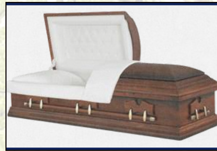
FREDERICK SOLID POPLAR Ivory Basketweave Interior $3,795