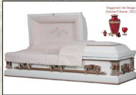
WHITE ROSE CEREMONIAL Cremation Rental, White Shaded Rose, Pink Chalet Crepe Interior $2,195