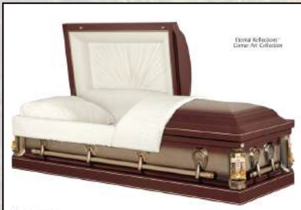
MARQUETTE, 18 GAUGE Arbutus Velvet Interior $4,395