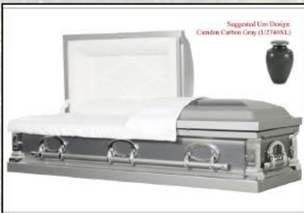
MEMORY SILVER & GRAPHITE CEREMONIAL Cremation Rental, Two Tone Silver & Graphite, White Chalet Crepe Interior $1,995