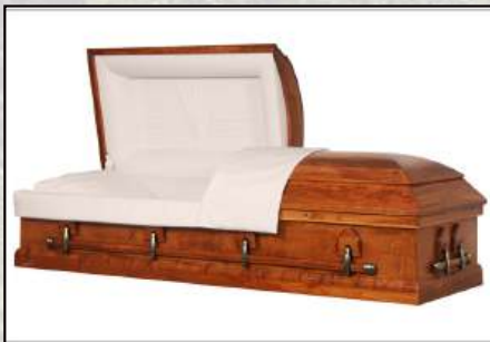
COLLINWOOD VENEER Rosetan Crepe Interior $3,195