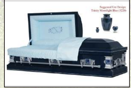
LORD'S PRAYER CEREMONIAL Cremation Rental, Dark Blue With Silver Pinstripe, Blue Chalet Crepe Interior $1,795