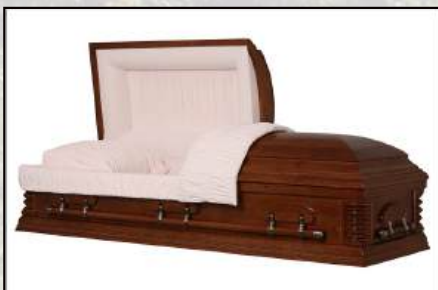
ALLEGHANY CHERRY Rosetan Velvet Interior $6,695