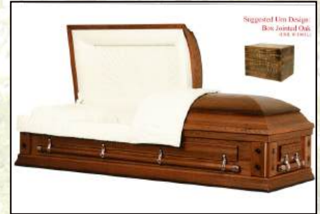
NORWOOD OAK Cremation Rental, Medium Brown Satin Finish, Rosentan Chalet Crepe Interior $2,095