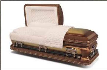
VENETIAN BRONZE, 48 OZ. BRONZE Premium Champagne Velvet Interior $9,595