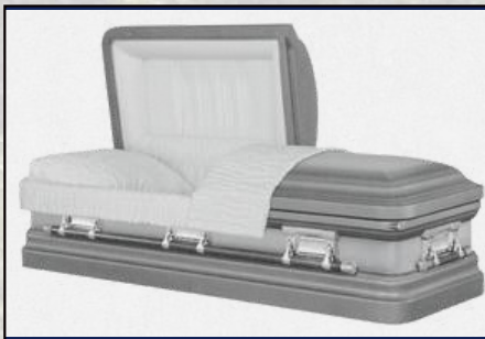
GEM STEEL, 18 GAUGE Silver Crepe Interior $3,795