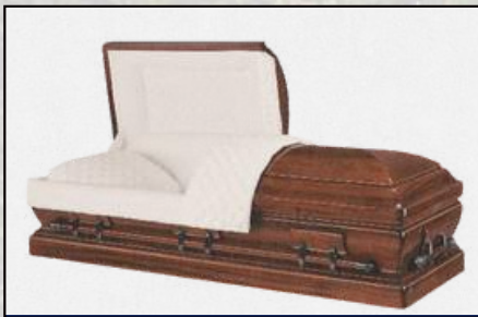
OLYMPUS MAHOGANY Ivory Velvet Interior $7,395