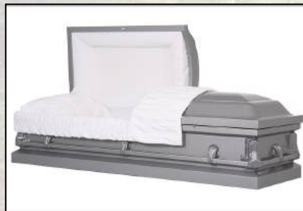
WINSTON SILVER, 20 GAUGE NON-GASKETED White Crepe Interior $1,595