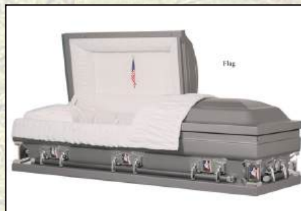
OLYMPIC SILVER 27, 20 GAUGE White Crepe Interior $3,495