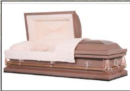
TREEMONT COPPER, 20 GAUGE Rosetan Crepe Interior $2,595