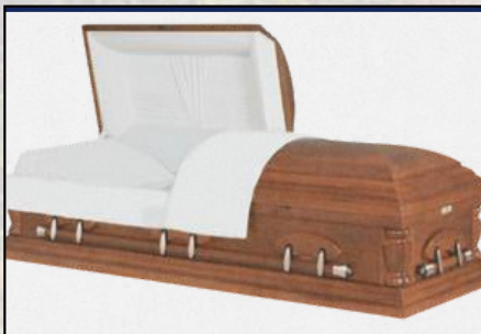
SOVEREIGN PECAN Ivory Velvet Interior $4,395