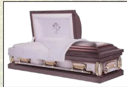
MEADOW MERLOT, 18 GAUGE Orchid Crepe Interior $3,595