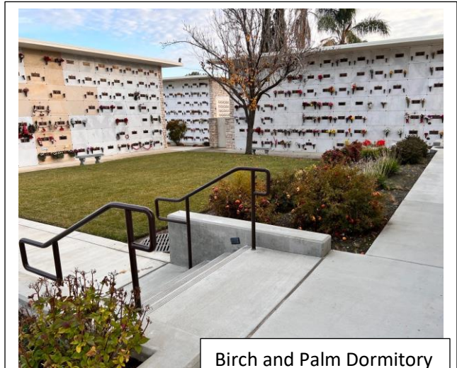
Birch and Palm Dormitory

Porcelain Markers for Single and Companion Niches